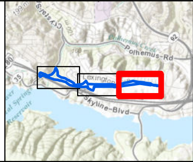
FIGURE 2a RESULTS OF WETLANDS SURVEYS LINE 109 BUNKER HILL PIPELINE REPLACEMENT PROJECT FEBRUARY 4, 2014